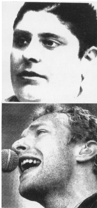
Alessandro Moreschi (top), was the last known castrato, whose emotional impact has been likened to pop singers such as Chris Martin of Coldplay (bottom)

It will show that for all the pain caused in the 17th and 18th centuries, when up to 4,000 boys a year were castrated in the service of art, the rewards could be immense. They earned fortunes far in excess of what Handel himself earned and more than other singers of the time. One castrato, Caffarelli, a notoriously difficult man to work with, accumulated sufficient wealth to buy himself an Italian dukedom on retirement.